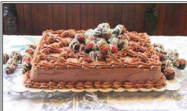
Chocolate cake was enjoyed by all