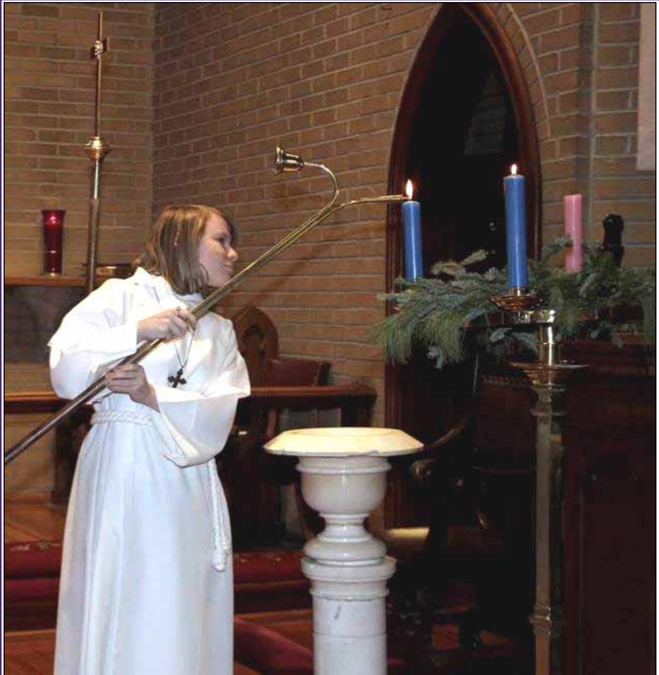
Christmastime at St. Alban's Church