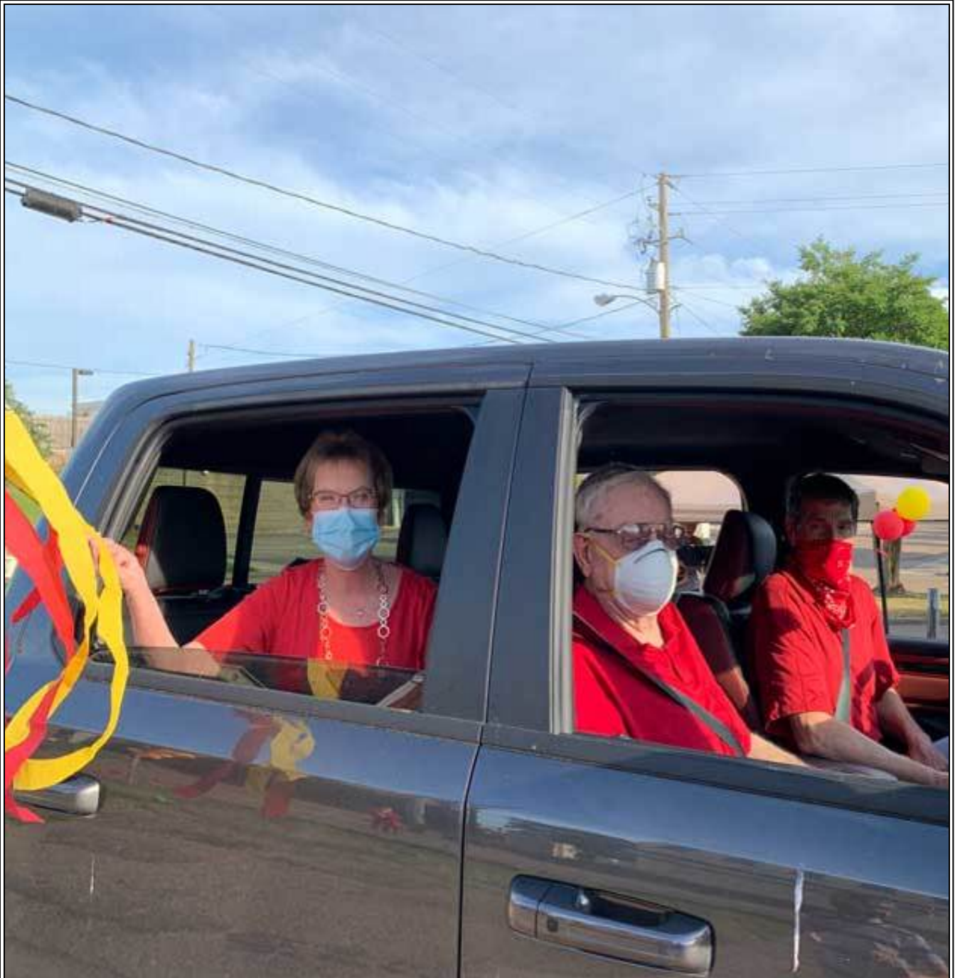
Pentecost Sunday Drive-Through