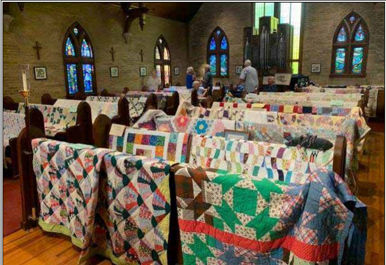
The quilts displayed in the church nave were awesome! Everyone enjoyed the exhibit as they shared their techniques and stories.