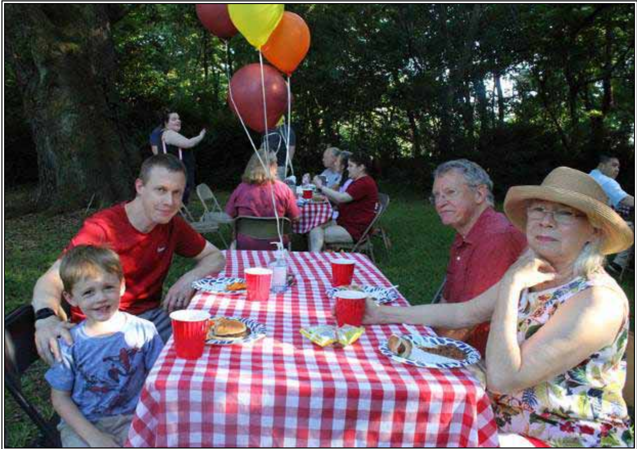
Church members & guests enjoy visiting and picnicking on historic church grounds