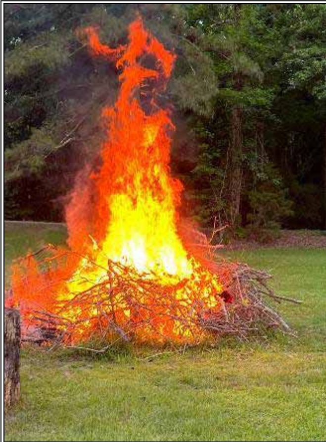
Fire represents the Holy Spirit that filled the Apostles with enthusiasm, replacing their fear with the courage to go forth and share Christ's story