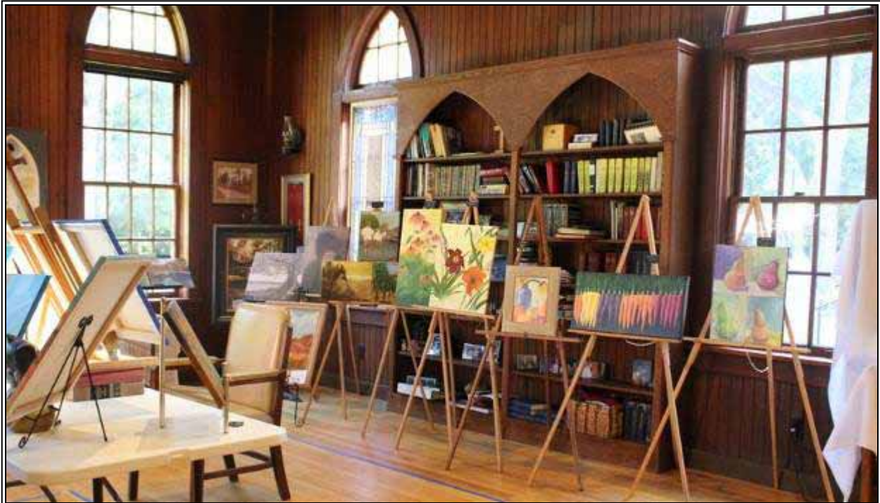
The community of St. Alban's enjoyed an arts exhibit in the Parish Hall that featured paintings as well as items made by local artisans