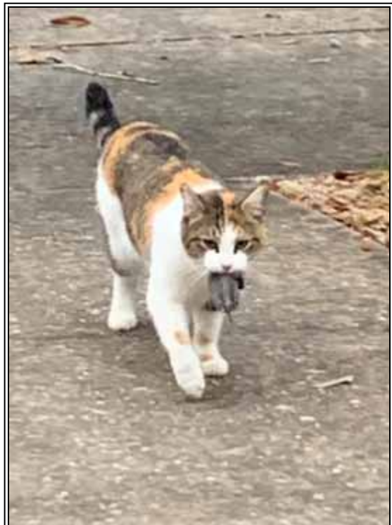
Salome brings a Sunday offering