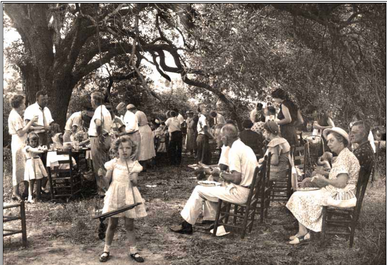
Classic sepia photograph of church members enjoying Dinner on the Grounds taken in the 1940s. Note the ladder-back chairs and the old oak tree—a St. Alban's landmark.