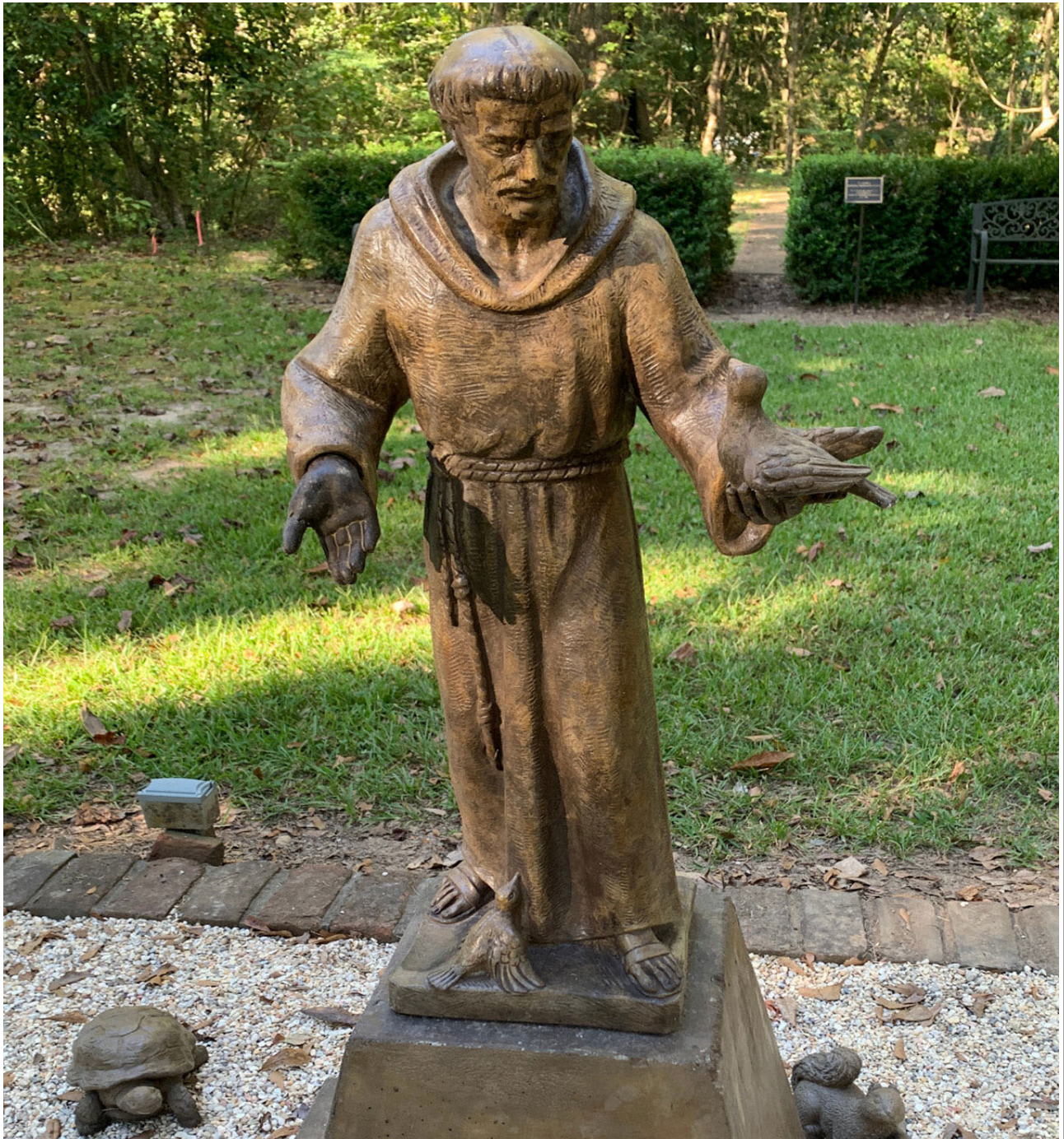
The Feast of St. Francis of Assisi The Patron Saint of Animals