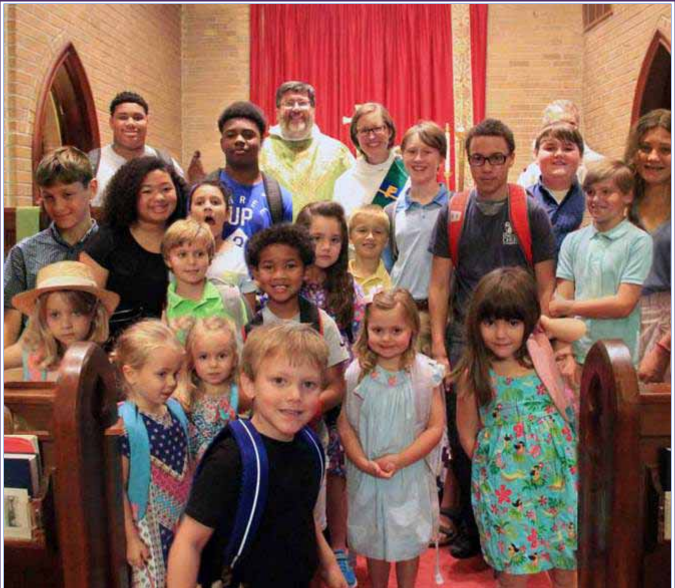
Back to School—Blessing of the Backpacks