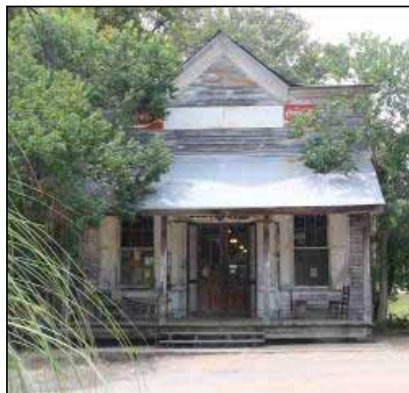
Tuesday, August 25 Gibbs Grocery Dinner, 5:30 PM