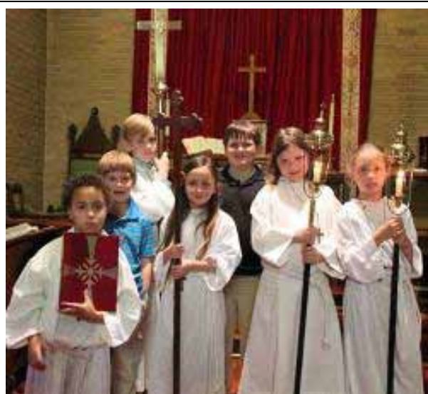
Sunday School Kickoff, August 16 Children's Sunday 11:00 AM Eucharist