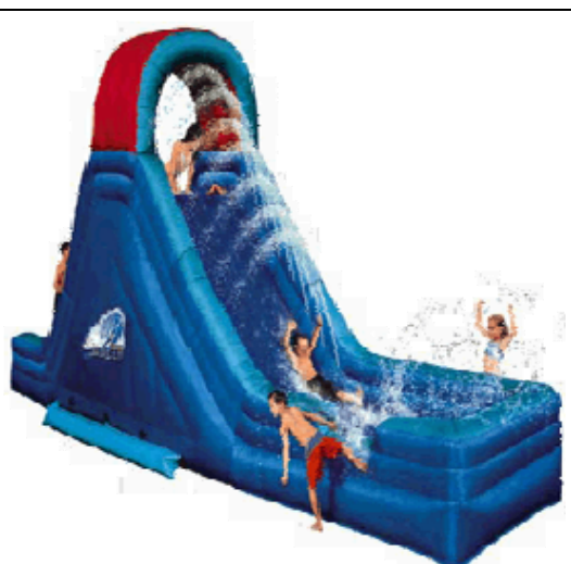
Sunday School Kickoff, August 16 Following the 11:00 Eucharist Water Slide & Picnic