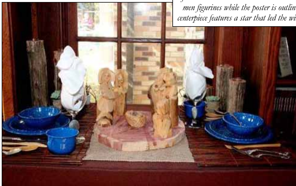
Christmas by Rev. Billie Abraham

Table setting features a green & white tea set with green napkins. A life-sized camel poster sets the tone for the arrival of the wise men. The table is decorated with camel and wise men figurines while the poster is outlined with lights - the centerpiece features a star that led the wise men to the stables