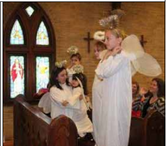
2014 Christmas Pageant