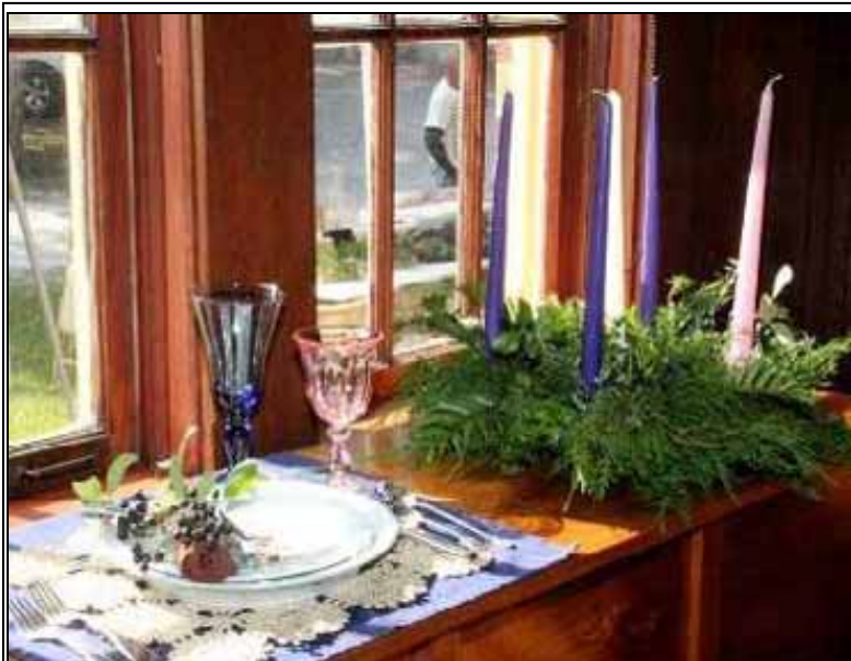
Advent by Cassandra Price

Table setting features purple and pink colors, reflective of Advent - Advent wreath, Advent icons and a table setting of colorful china and crystal