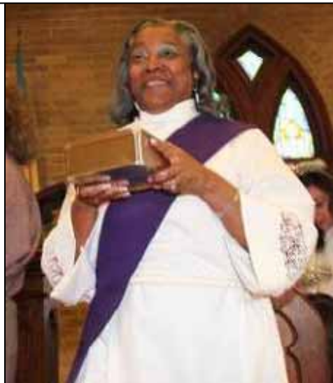
2014 Christmas Pageant