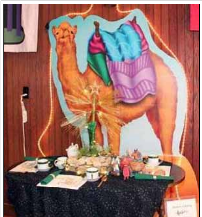
Epiphany by Dale Gibson & Tommy Skinner

Table setting features purple and pink colors, reflective of Advent - Advent wreath, Advent icons and a table setting of colorful china and crystal