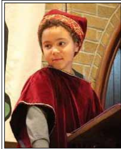
2015 Christmas Pageant