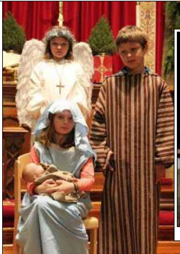
2015 Christmas Pageant