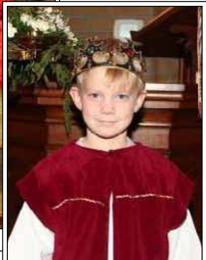
2013 Epiphany Pageant