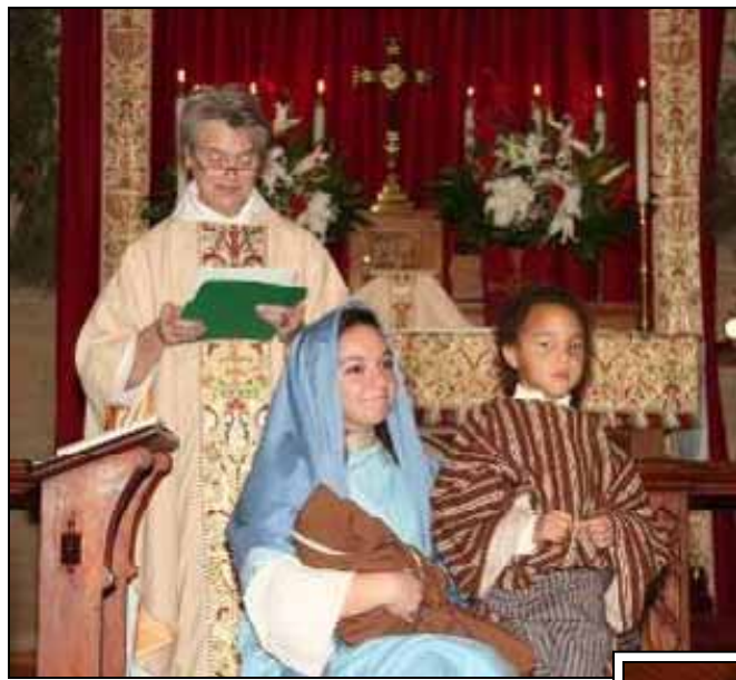
2013 Epiphany Pageant