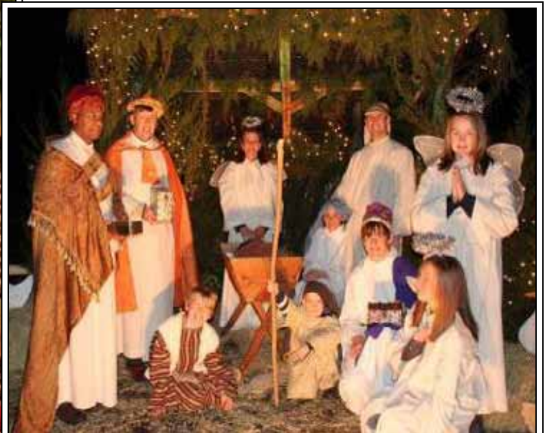
2011 Nativity Scene