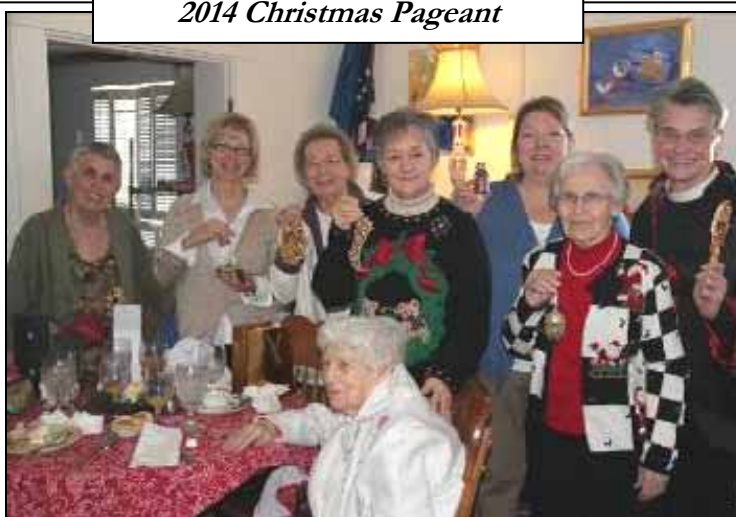
2011 ECW Ornament Exchange