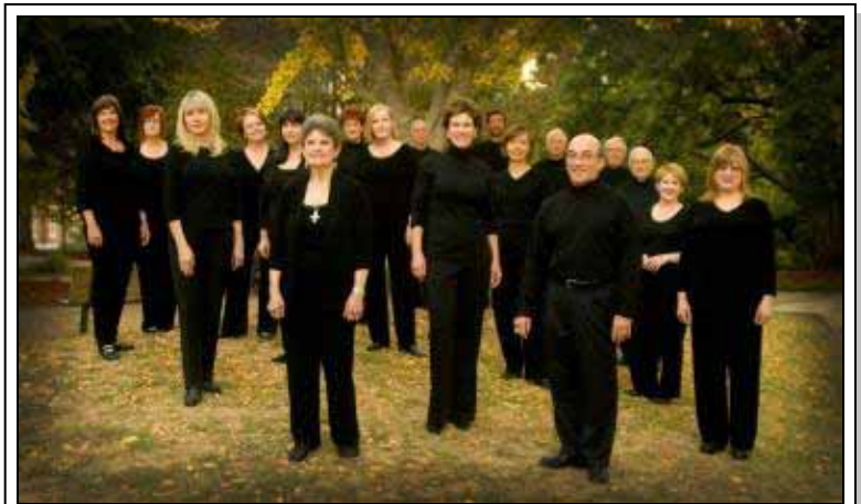
Galloway Methodist Concordia Ensemble