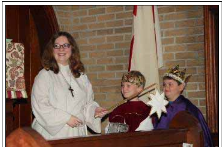
2012 Epiphany Pageant

Feast of the Baptism of Christ Annual Parish Meeting & Potluck Luncheon