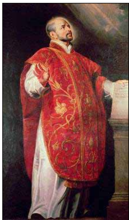
Ignatius of Loyola (1491-1556)

I am currently reading The Lord's Prayer: Jesus Teaches Us How To Pray . The book is divided into six weeks with questions at the end of each week. The reader is encouraged to journal and to practice Examen .