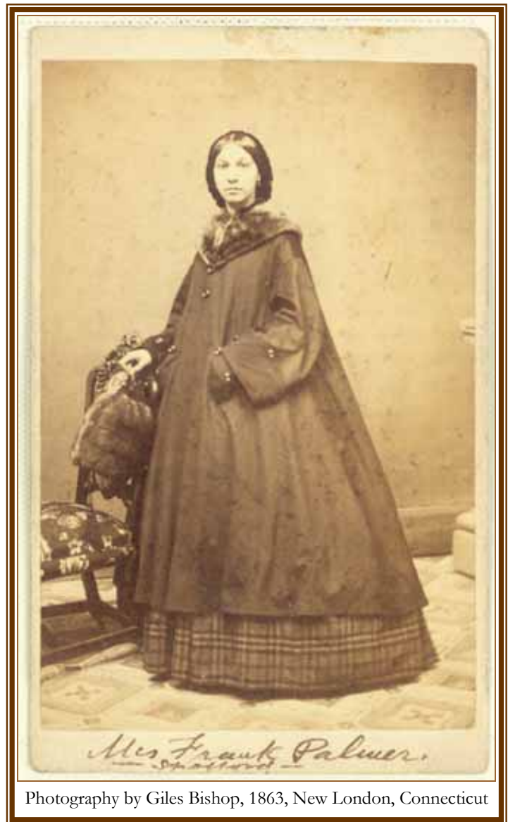
Photography by Giles Bishop, 1863, New London, Connecticut

Then, just several weeks before Owl Roost Plantation was due to go to print, the curator of the New London Historic Society (Connecticut) called to say that he had located a photograph of Louisa Townsend in the files. The picture, dated 1863, was