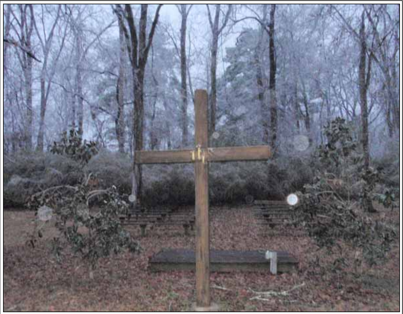
Outdoor Chapel Blanketed in Ice