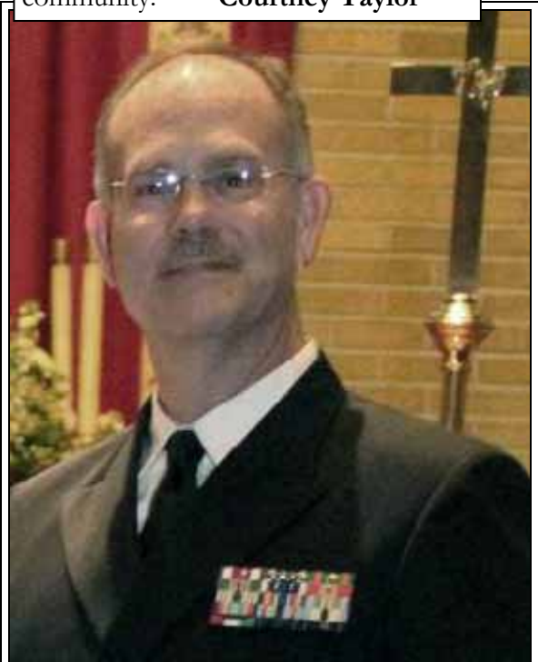
“Stewardship must address not only what St. Alban’s needs here and now, but many years into the future. A program of planned giving, together with means such as an endowment, are essential tools to promote St. Alban’s vitality and longevity.” Rymn Parsons