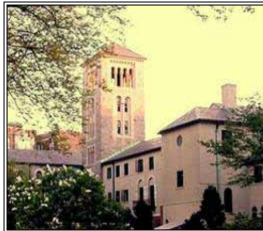
Monastery of Saint John the Evangelist