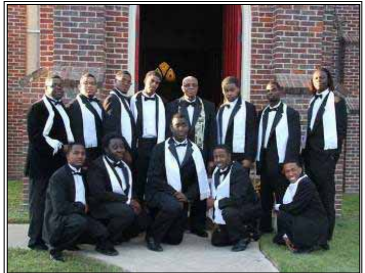
St. Mary's Homecoming Eucharist featuring the Jubilee Singers, September 9 th , 4:00 pm.