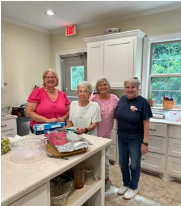
Our “dream team” of food shoppers and dinner coordinators

Thank you to the many volunteers who made arts camp at Lifting Lives a huge success! From the team who prepared dinners each night to the volunteers willing to get messy with crafts, thank you to everyone who pitched in! Each evening, we had anywhere from 10-15 kids of all ages gather for dinner, a story, and activities focused on creativity.