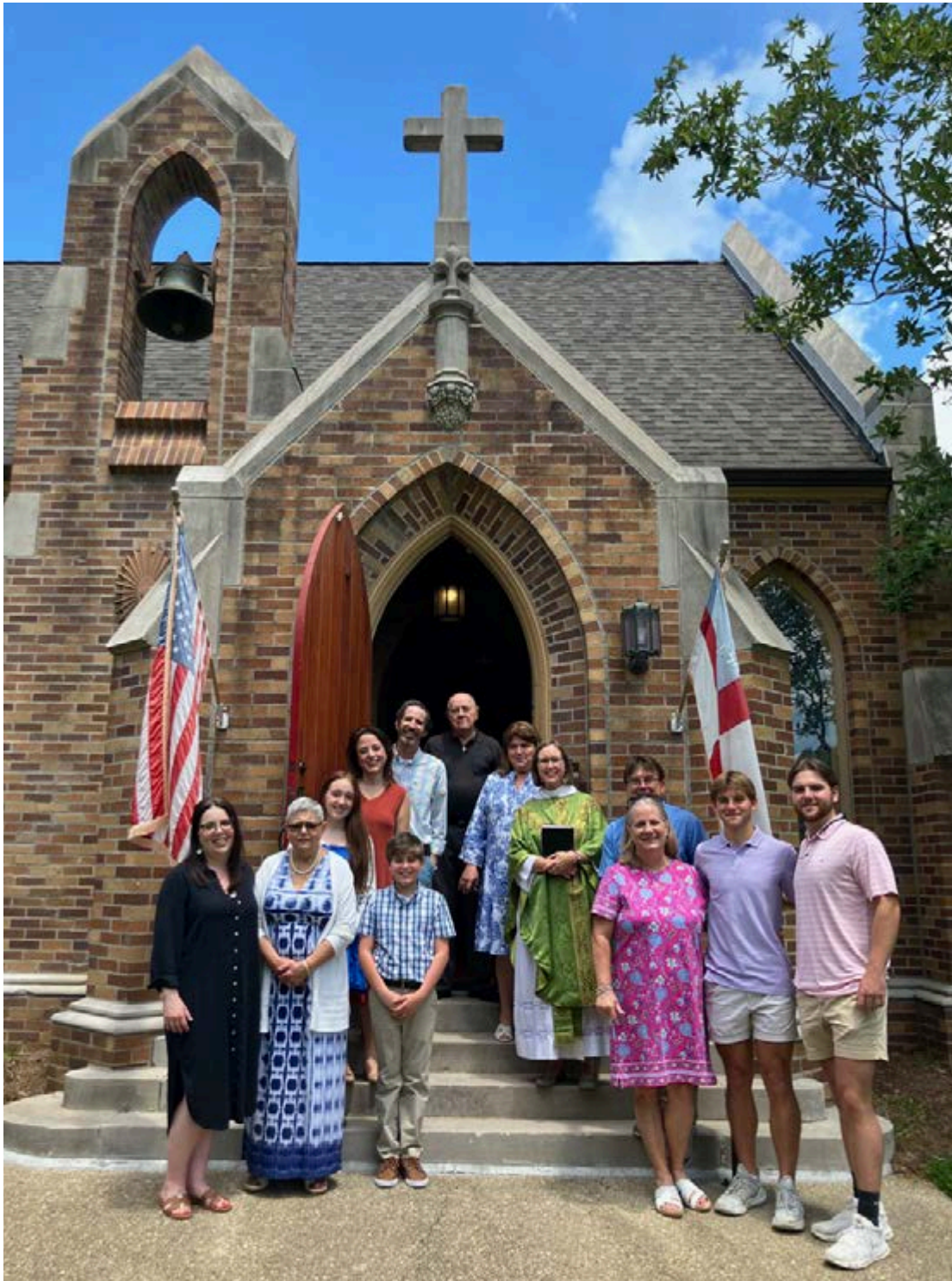
Summer Worship at St. Alban's