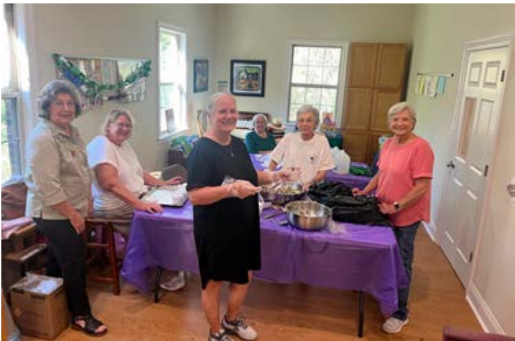
The formidable slaw team!