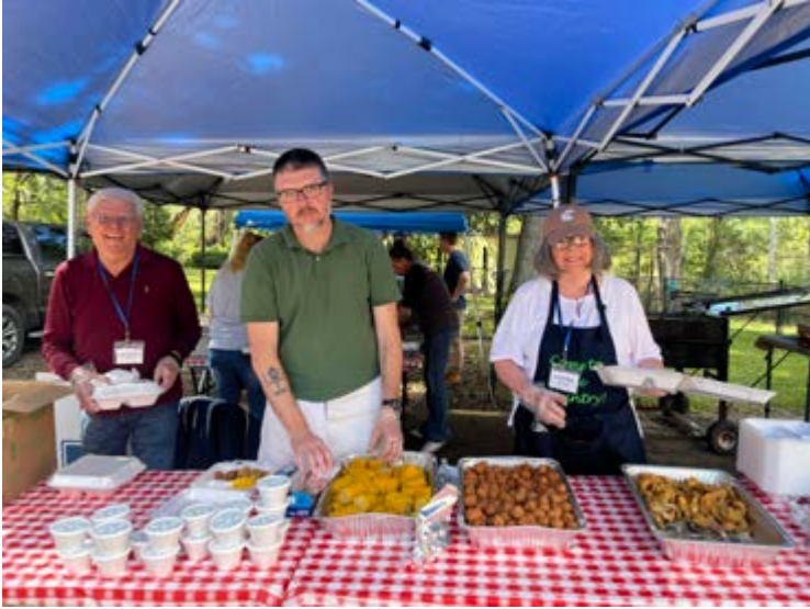
Harvey, Buck & Penny preparing plates