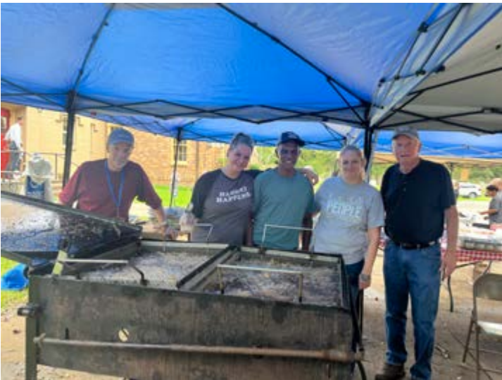
The fish frying team

All proceeds from the Dinner on the Grounds were donated to Lifting Lives Family Shelter in Vicksburg. Rounded up with outreach funds, we were able to write a $3,000 check to Lifting Lives! Thanks to everyone who volunteered and helped to make the event a day to remember!