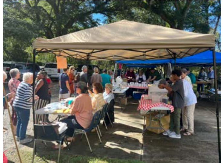
Lots of hungry guests