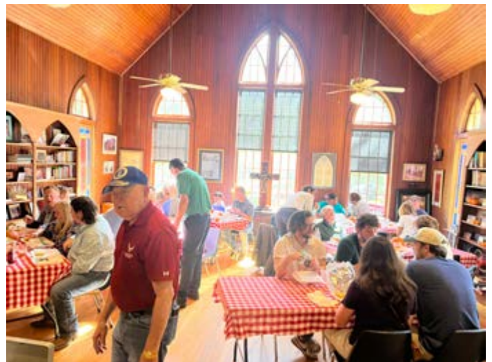
Guests enjoying the food & fellowship