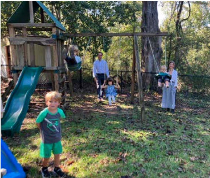
Enjoying the beautiful weather