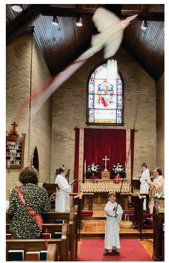
Fore flies the dove