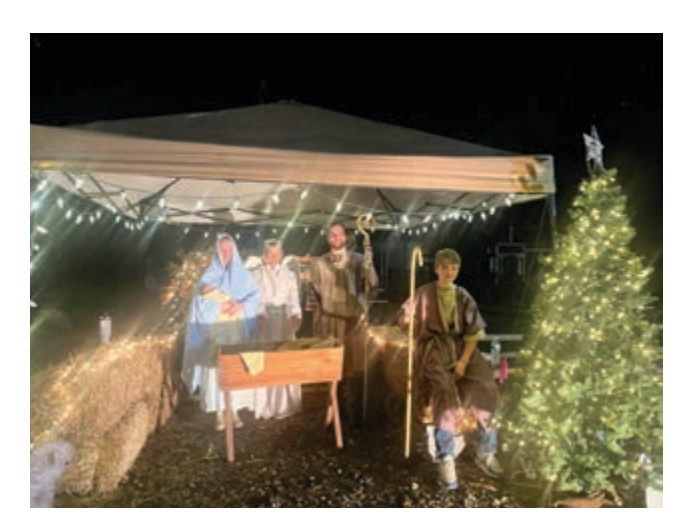
The Holy Family