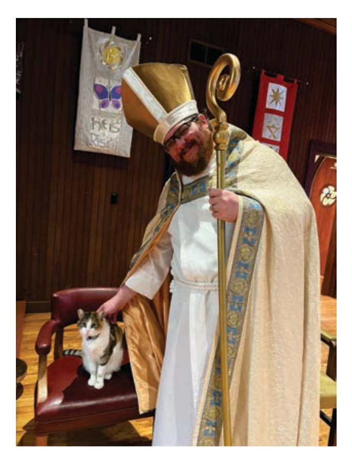
St. Nicholas & Sallie Mae