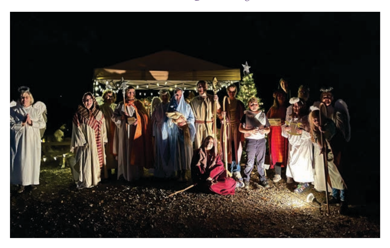
Do not be afraid, for see, I am bringing you good news of great joy for all the people: to you is born this day in the city of David a Savior, who is the Messiah, the Lord.