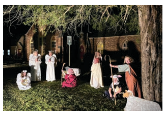
Angels & Shepherds