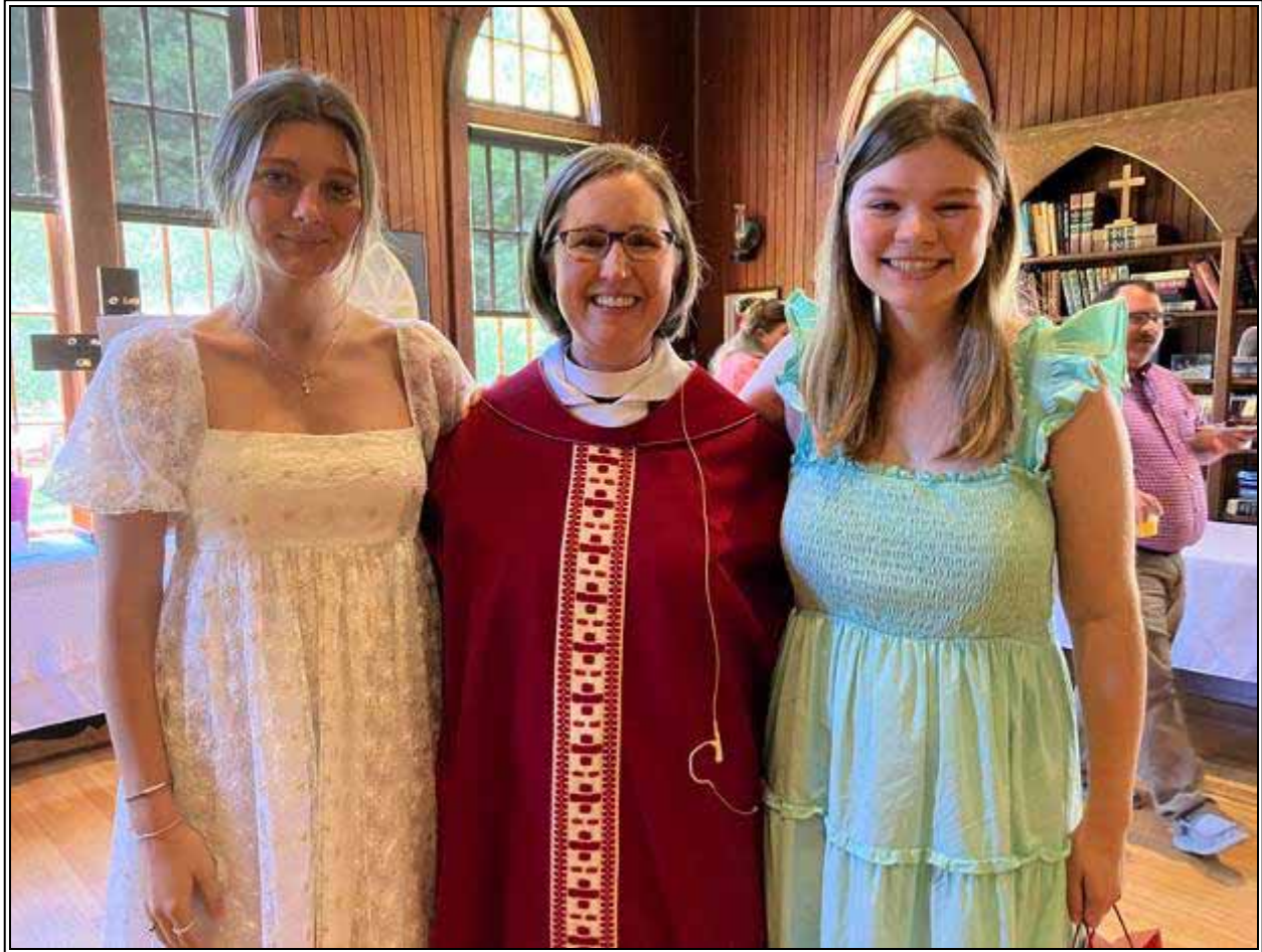
Cake & punch reception held in the Parish Hall honoring the graduates