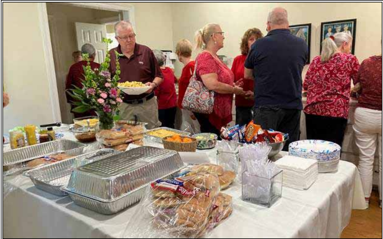
Church members enjoying good food and fellowship—“Bless Be the Tie that Binds, Our Hearts in Christian Love”