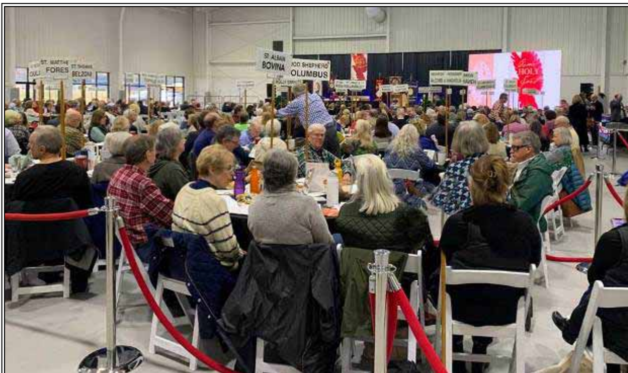
St. Alban's delegates prepare for the election of a new bishop