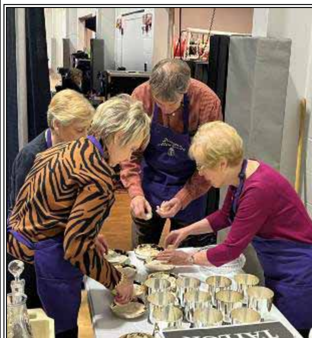
Altar Guild members repairing for communion