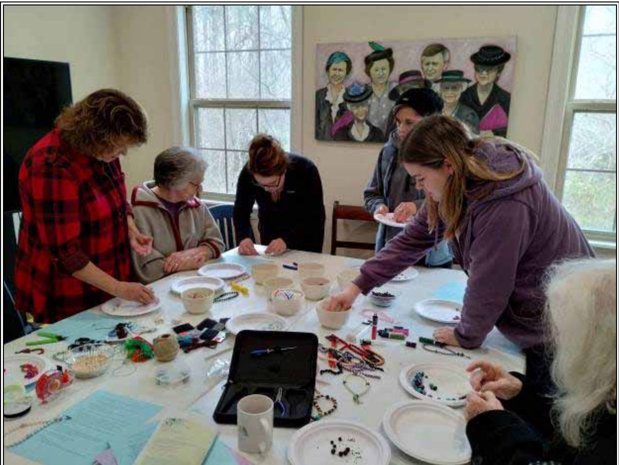
Making Anglican Prayer Beads