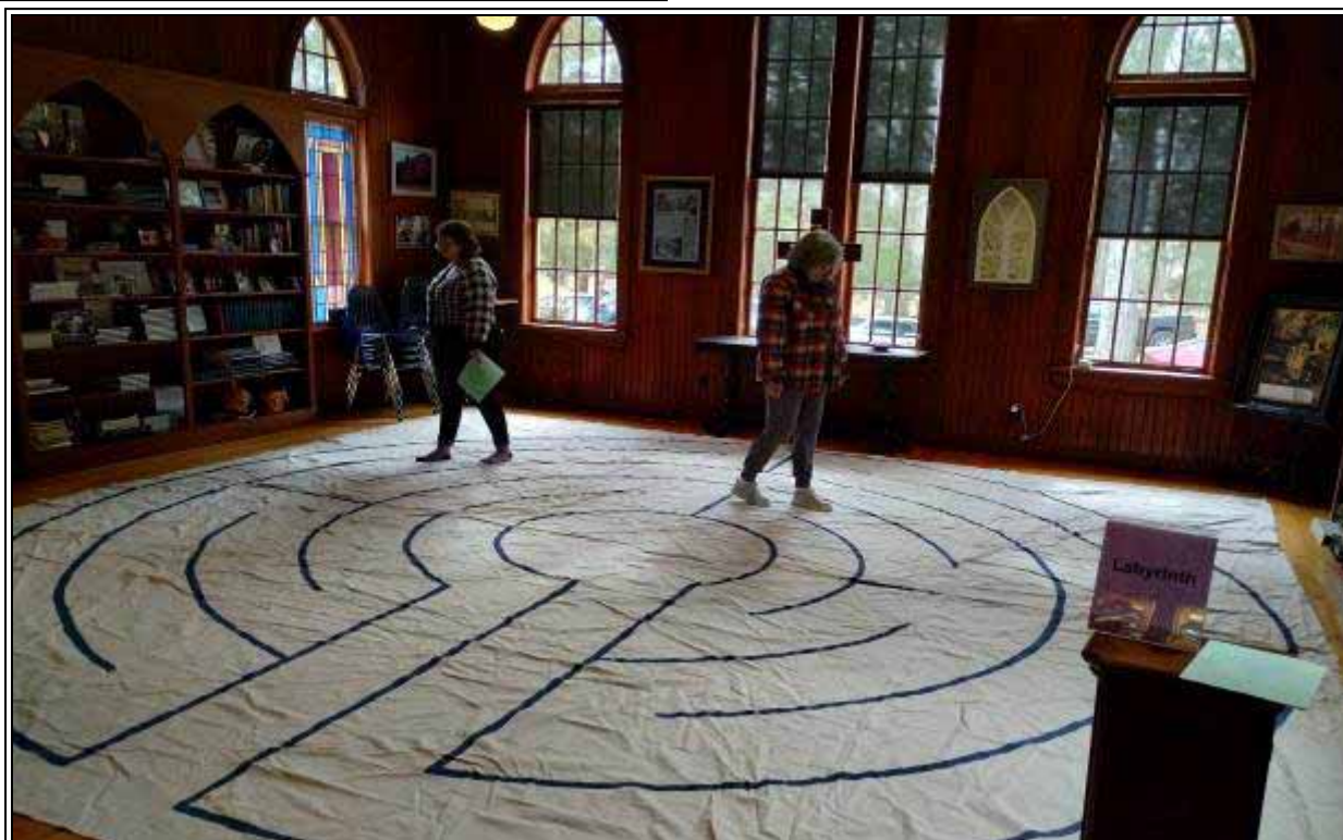
Walking the Labyrinth