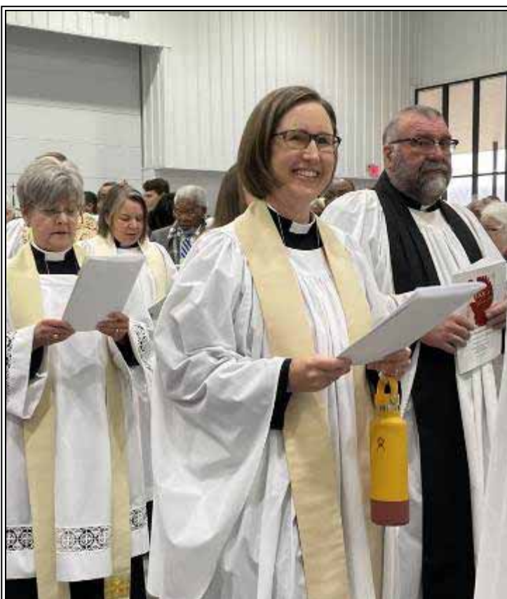
"Go forth for God, go to the world in peace"