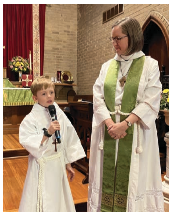
Fore shares about Cub Scouts