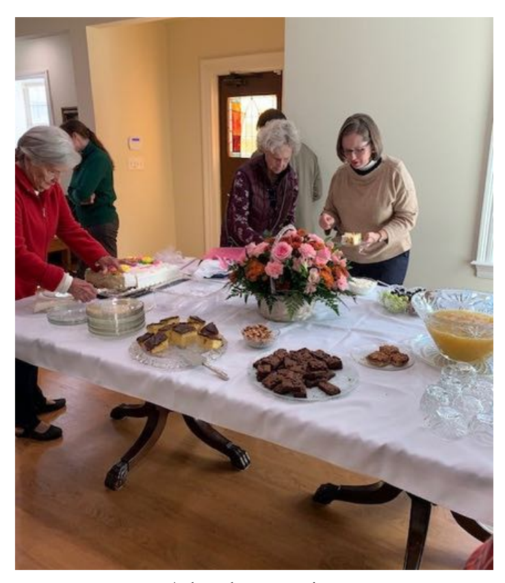
A lovely reception