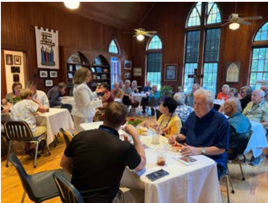
Time for conversation