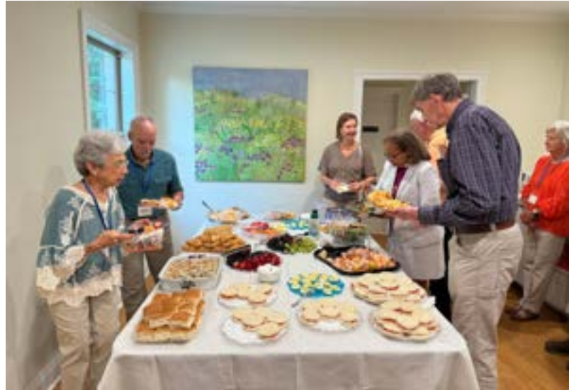
The Vestry provided a fabulous spread